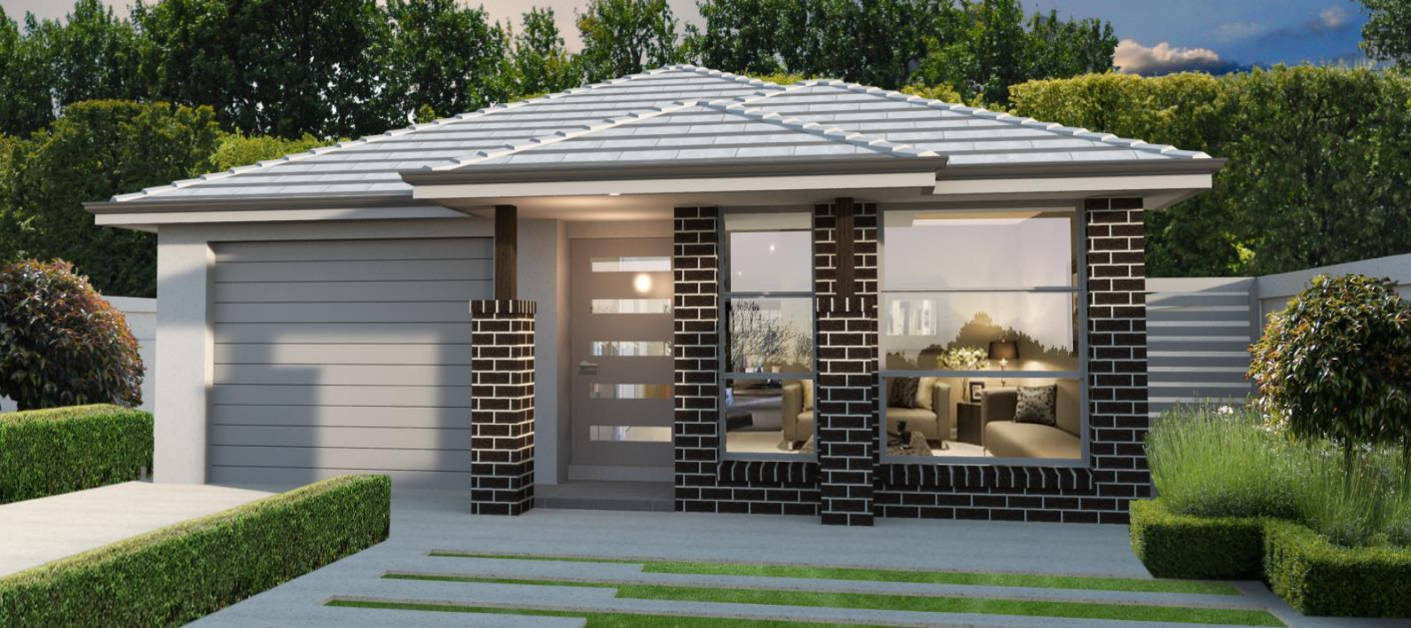
Façade is for illustration purpose only. This façade shows upgraded items not included in standard façade selection.