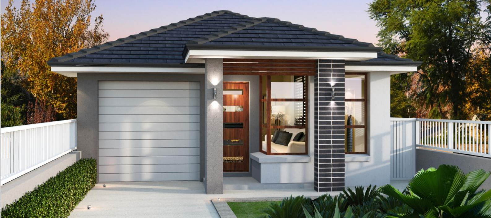
Façade is for illustration purpose only. This façade shows upgraded items not included in standard façade selection.